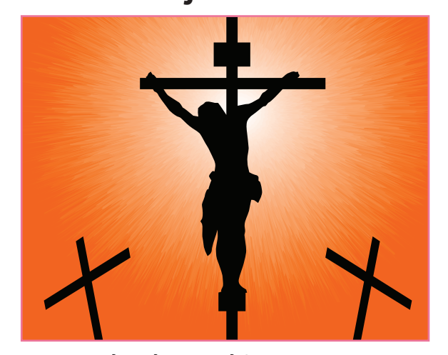
Was Good Friday good for Jesus?