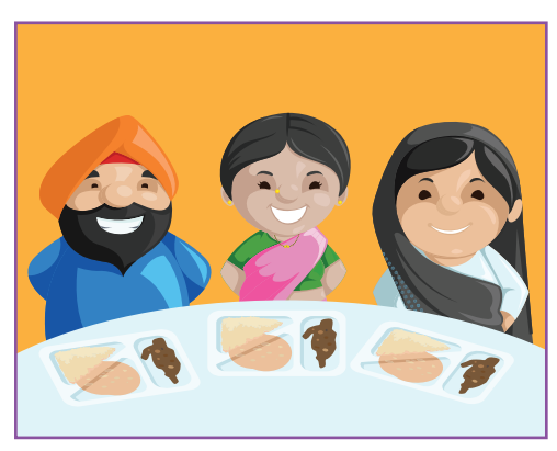
Sikhs sharing the Langar meal