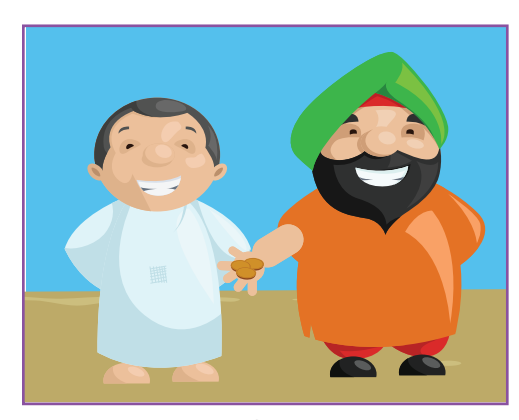
A Sikh being kind to someone