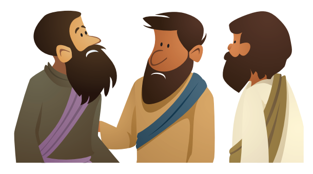
Was Good Friday good for the disciples?