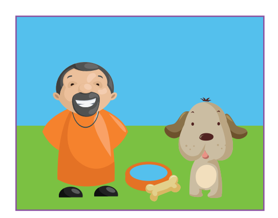
A Sikh being kind to animals