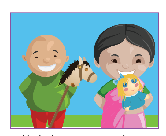
Sikh children playing together